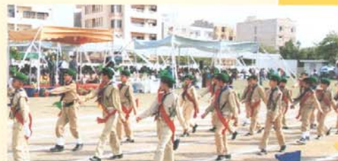
Young students Marching on Annual Day

The chief guest, Administrator DHA, distributed prizes amongst the students who excelled in various curricular and co-curricular activities. He also announced a cash award of Rs. 45,000/= for the College.