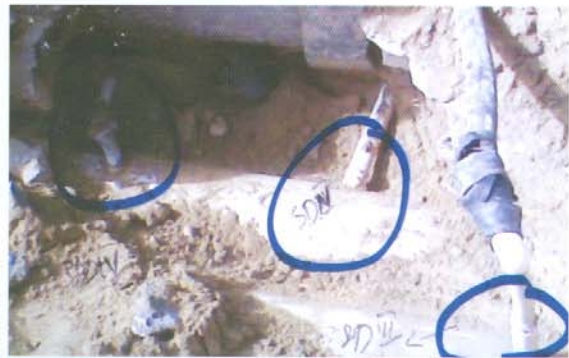
Illegal water connections

The respectable residents of DHA are once again requested through this DHA Newsletter not to use illegal means to get excessive water. If so, it will have a positive effect on the lives of all DHA residents and will also help DHA to provide better services.