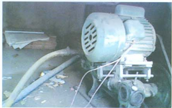
A view showing illegal water suction pump