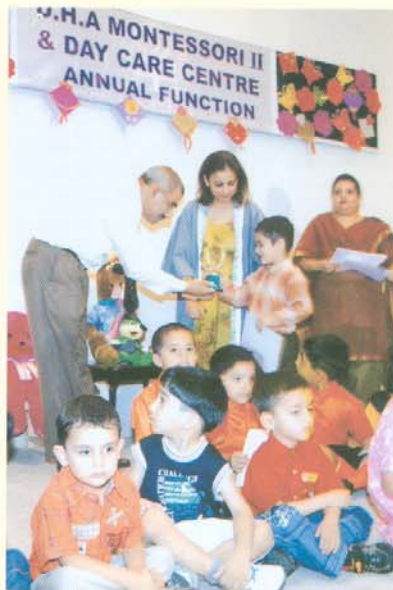
Children performing on Annual Day Function

Annual Day Function of Defence Authority Montessori-II was held in the auditorium of Defence Central Library on April 30, 2008.