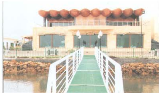
A view of the exquisite exterior of the Club

He also congratulated the Commander Coast, Event Management Company Concepts Unlimited and City District Government, Karachi for joining hands to organize the event and look forward to the support of all relevant departments and organizations for great success of the Gala.