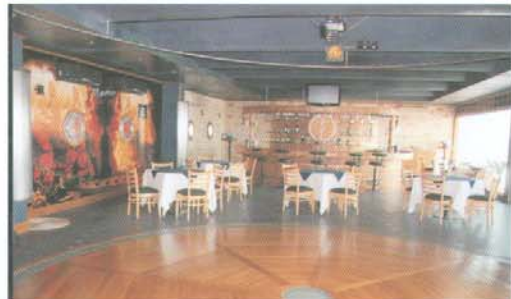
An exotic dine-in experience in the dining area of the Club