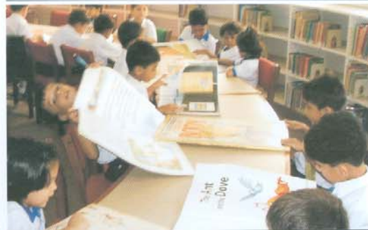
Children absorbed in recreational activities during Summer Camp at Defence Central Library

“The aim of education is the knowledge of not fact, but of value.”