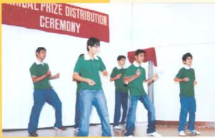
Boys performing on Annual Day Function

The annual day function of Defence Authority High School Phase VII was held in the School's auditorium on April 15, 2008 to give awards to the students who got "A" and "A+" grades in the matriculation exam of the Karachi Secondary Education Board.