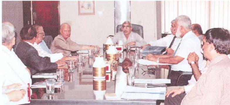
Administrator DHA presiding over a meeting held between DHA's Management and DRS Delegation at DHA's Main Office