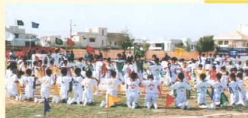
Young students performing on Annual Function Day