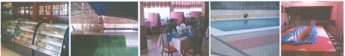
Various attractive and breathtaking views of the Club.