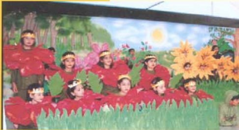
Children giving spectacular performance in the Urdu play “Phoolon Ki Faryad”