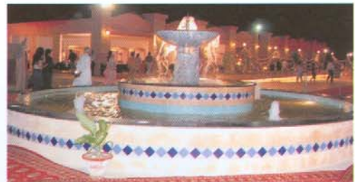
A colorful view of the beautiful fountain at DA Country & Golf Club

In terms of percentages, 80% of the facilities are installed in the club are now in operation. Moreover, the DA Country & Golf Club is steadily moving towards its final phase of development with all its facilities to be operative before the last quarter of 2008.