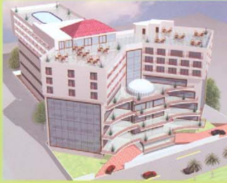
A view of the state-of-the-art DA Beach View Club.

There is a plan in hand to construct a multi-storey building at the present site of Beach View Club, with maximum glass view overlooking Arabian Sea, housing all possible modern Club facilities of international standard. Renowned consultants are presently working on the initial design and graphic representations.