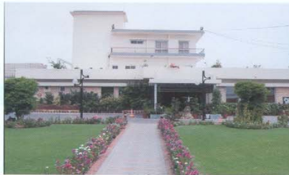
A view of the serene and lush ambience surrounding the exterior of the Club

Defence Authority Club is the oldest in the series of Clubs in DHA. It boasts of its name and popularity for its atmosphere and standard in general and for a variety of five star foods, film shows, tombola, and periodical musical shows, fun fair/member's get-together in particular. Dining facilities are comparable to a Five Star Hotel in the city. The club remains under a dynamic process of uplifting and beautification.