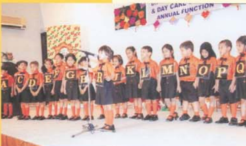
Young students performing on Annual Function Day

The annual day function and prize distribution ceremony of Defence Authority Junior Model School Beach View was held at the school premises in Sea View Township on the morning of March 07, 2008.