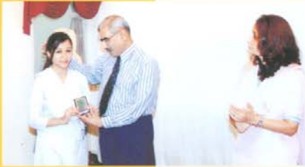
A student getting a shield on achieving excellent grade in exams