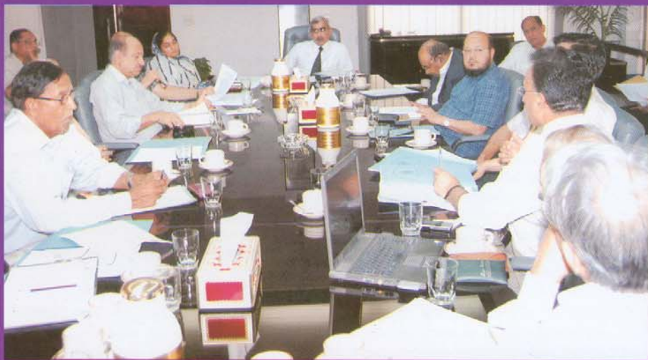
Administrator DHA, Officials of DHA and CBC in a meeting with ADR delegation

ADR delegation was informed about the Phase-II of the new DHA Drainage Project where all dug up roads would be leveled, carpeted and completed with appropriate slopes to ensure quick drainage of standing rain water.