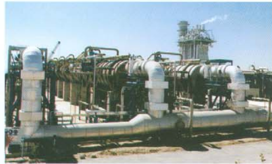
A view of the DHA Co-generation Water and Power Plant

The Housing Authority has also put in place high and low voltage infrastructure including grid stations at its own cost ensuring connectivity to KESC distribution systems. Designed to become high value assets of KESC ultimately, the investment for power cable infrastructure has been made fully by DHA.