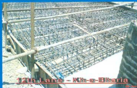
12th Lane - Kh-e-Bharia